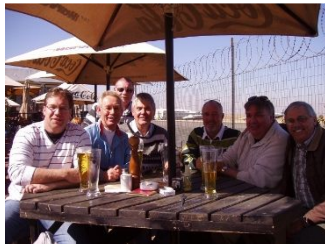
The Brethren 'at refreshment' after a grueling District rehearsal. Lol!!