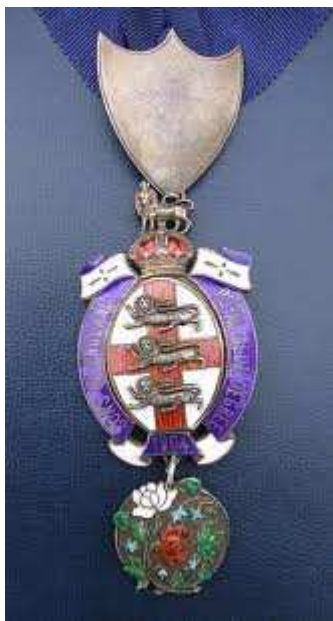
'Sons of England - Royal Blue Degree' collarette and silver jewel (1904)

The 'Sons of England' were a patriotic and benevolent society for British ex-patriots living in Canada and South Africa. The Society's first lodge was founded in Toronto, 1874 and other lodges were soon established throughout Canada and later in South Africa. Their organisation was modelled on freemasonry so their regalia and customs reflect this. It was quite usual for Benevolent and Mutual Societies of the time to model their organisational structures on the Freemasons. The last 'Sons of England' lodge closed in Canada during 1971.